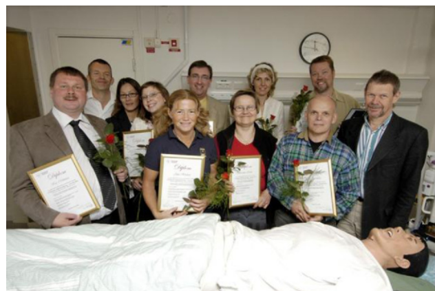
FIGURE 3. An important focus is the formal training of instructors, who must complete a 5-week formal university course for simulator instructors.

At the Center, we have a large variety of hybrid mechanical and virtual reality (VR) trainers, including black boxes and virtual reality simulators. Several part- and full-procedure VR simulators with and without haptics for laparoscopic cholecystectomy, laparoscopic bypass, gynecologic laparoscopy, gastrointestinal endoscopy, bronchoscopy, endourology, endovascular procedures, arthroscopy, and laparoscopic suturing models are located in the facilities of the Center for advanced medical simulation. The simulators are portable within the Stockholm County area for local courses. The Center also has access to several low-fidelity models that are available in collaboration with the clinical training center. These models include airway models, different anatomical human body forms, bench models, breast models, pelvic models including prostate model, and so on. The Center also has several human patient simulators (adult and pediatric). All are portable to allow in situ simulation in the emergency room or intensive care unit in Karolinska University Hospital or other hospitals in the Stockholm County Council area.